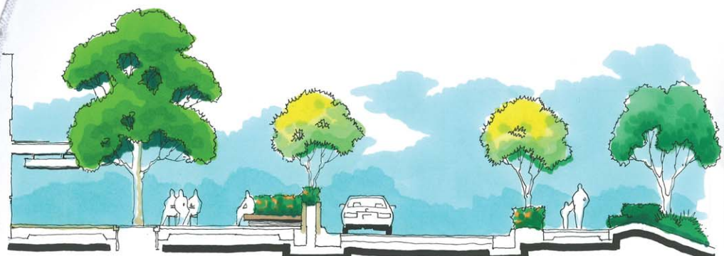
Section A-A through Firth Street - Breakout