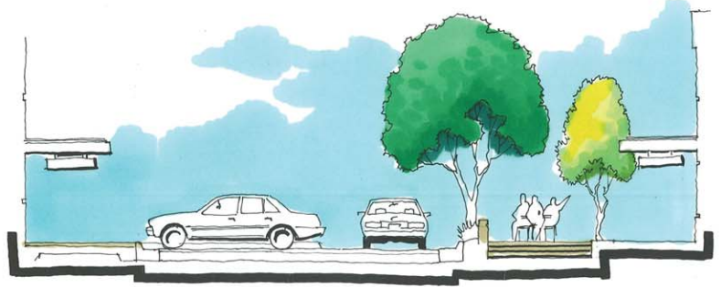
Section B-B through Belmore Street