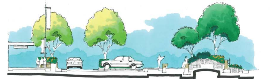
Section A-A through New Illawarra Road - Traffic Island