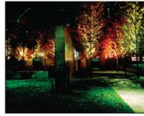
Park at Night Henry Beck Jm Park