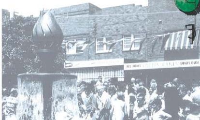
Tribute fountain (Bob Windle, olympic gold medalist) 1900's