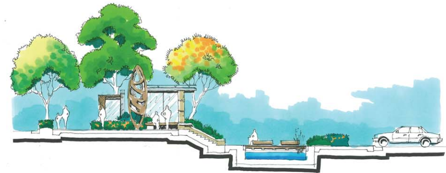
Section B-B through Bexley Road - Gateway