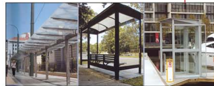
Bus Shelter Options Misc. Furniture - PLACE Library