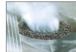
Visual Elements at Gateways Mee Fog - PLACE Image Library