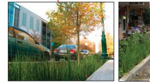
Typical Verge Planting Green Street Project - Portland