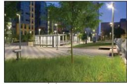
Gateway/Node Treatment University of Berkeley San Francisco