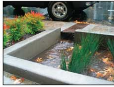
Car Park Median Green Street Project Portland