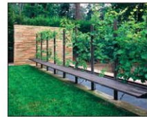
Seating/Screening PLACE Image Library